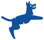
Dog Bites/ Animal Attacks