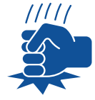
Business Interruption Claims