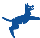
Dog Bites/ Animal Attacks