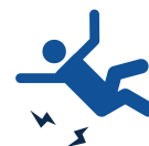
Slip & Fall